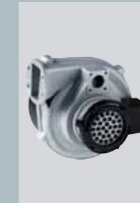
Radial blower with Lambda-Constant® system for intelligent condensing technology