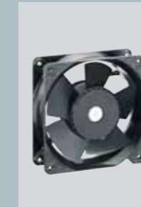
Axial fan for capacitor cooling