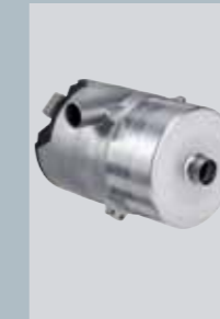
4-stage high-pressure EC blowers